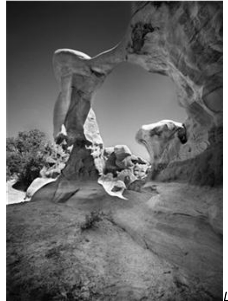
Landscapes by Clyde Butcher